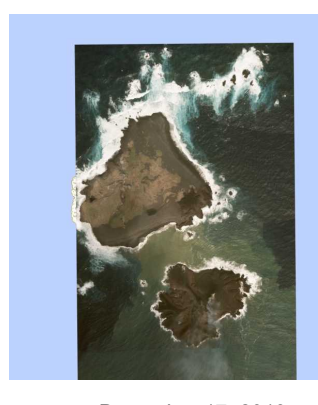
December 17, 2013