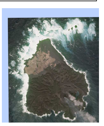
February 16, 2014

(Taken by manned aircraft "Kunikaze III")