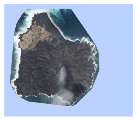
March 22, 2014