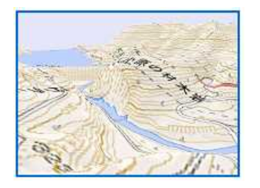
Obara in Shiroishi Shi A rocky column formed when magma cooled and solidified.