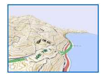
Yui in Shizuoka Shi A sharp mountainous district around the Suruga Wan. Landslide countermeasure project are also in effect.