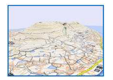
Yashima in Takamatsu Shi A table-shaped plateau surrounded by steep cliffs. It really is perfectly flat.