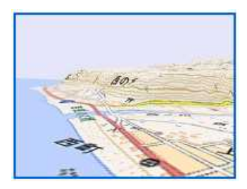
Kiragawacho in Muroto Shi Stair-shaped topography can be seen around the coast. A coastal terrace.