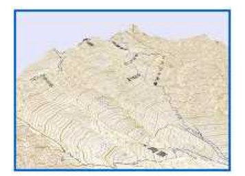
Yarigatake A mountain land with pointed peaks, with the mountain surface having been carved under the flow of glaciers.