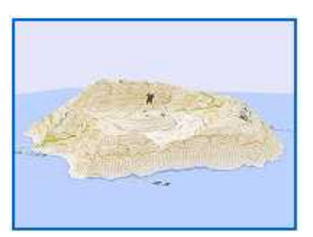
Aogashima Located 358km south from Tokyo. The double-layered caldera topography is impressive.