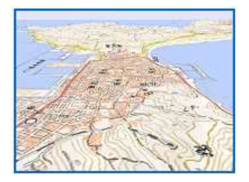
Shionomisaki An island that has been formed naturally by deposits of sand, due to the local flow of ocean water, to be connected to the main island.

Town areas are spread out at the foot of the mountains.